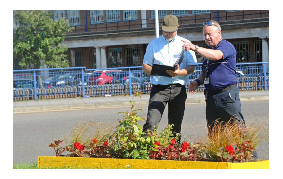
Seacombe roundabout: Seacombe resident and RHS judge

Phil from Seacombe spent countless volunteer hours working with Wirral Environmental Network to improve two roundabouts in Seacombe and create and plant up planters in Place in the Park, using recycled materials. He says 'Making Seacombe better means a lot to me, I wanted to make people proud of the community where we live, I've used flytipped materials found in and around Seacombe to create the planters'.